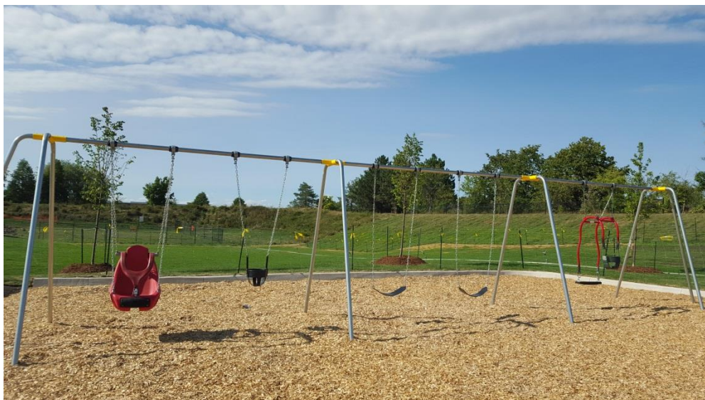
Union Park playground located on the NE corner of Tenth Line W. and Aquitaine Ave.