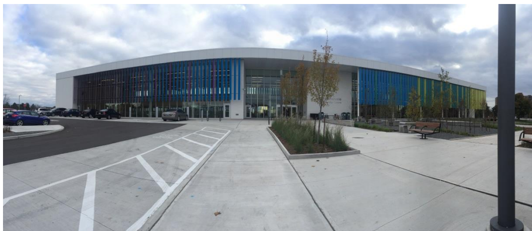
Meadowvale Community Centre and Library, front entrance.