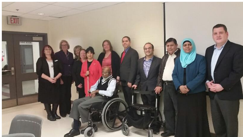
Mississauga Accessibility Advisory Committee

Mississauga's Accessibility Advisory Committee (AAC) advises, recommends and assists the City in promoting and facilitating a barrier-free community for citizens of all abilities (universal accessibility), including persons with disabilities.