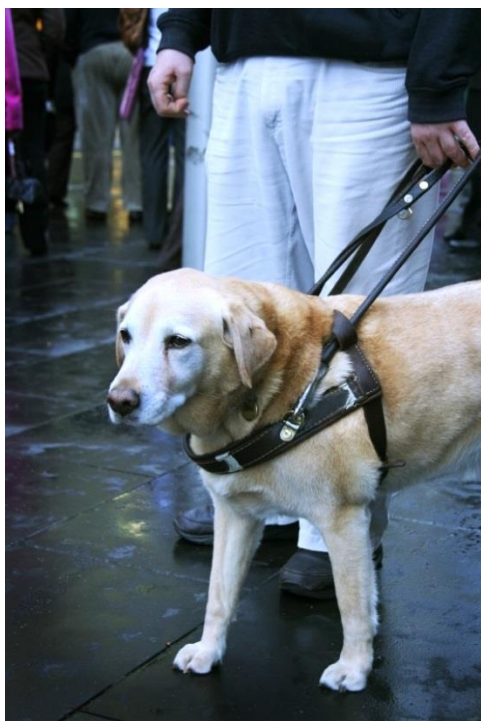
Guide dog with harness at work.