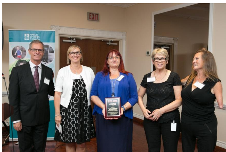
Receiving March of Dimes Award of Merit for Barrier Free Design for Meadowvale CC and Library